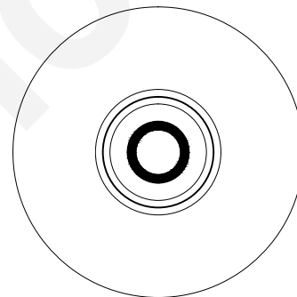
BASE BOTTOM VIEW